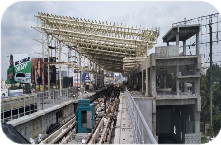
R-5-P1: Electronic City-1 Station Roof Sheetting Work in progress