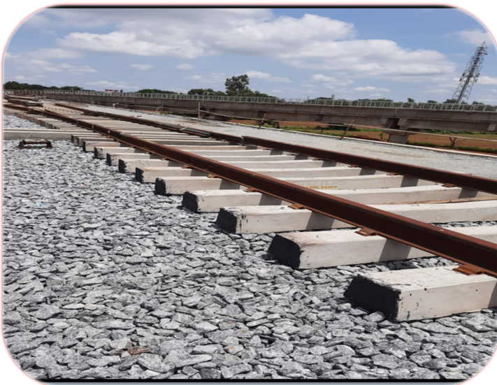
Reach-1 Extn: Ballasted Track Work at Kadugodi Depot