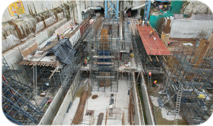
R6 UG RT-04: Venkateshpura Station South side shaft view