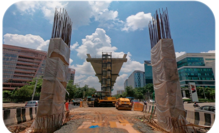
Ph2A/P2 – ORP472: Portal Pier concreting completed up to tie beam level