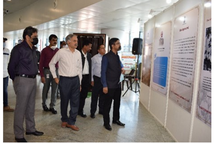
Portraits of partition horrors was displayed as part of Partition Horrors Remembers Day at Nadaprabhu Kempegowda Station Majestic