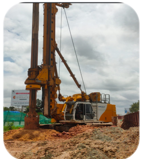
Ph2B/P3 – Piling in progress at AP775