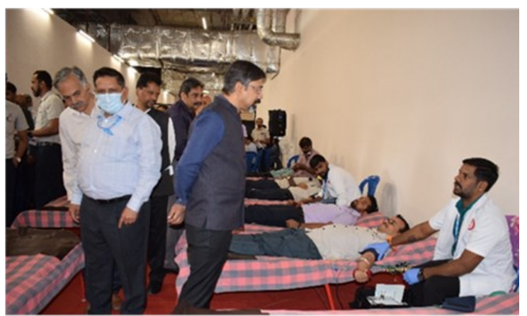
As part of Azadi Ka Amrith Mahotsav, BMRC Staff voluntarily donated blood as a humanity service at the Blood Donation Camp organized on 12.08.2022 at Nadaprabhu Kempegowda Station Majestic