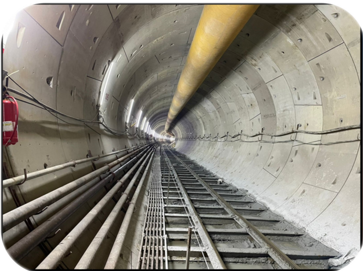
R6-RT-01: TBM 3-1264 (Varada)-RMS Shaft to Langford Town – Completed