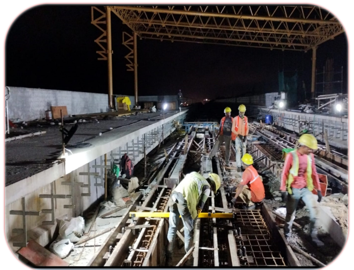
Reach-3 Extn: Track Work at Jindal Station