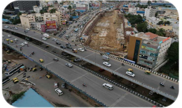
R6 UG RT-04 Aerial view of Nagawara Station