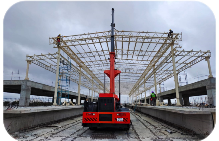
R5-P3: BTM Station Roof Truss Erection in progress