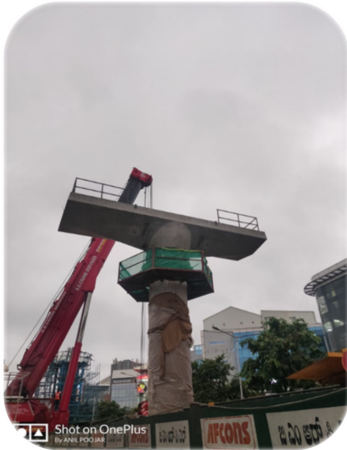
Ph. 2A/P1– Pier Cap erection at ORP-213, 216 & 217