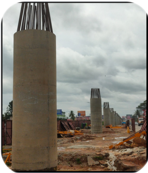
Ph2B/P3 – Longitudinal View of Casted Piers from AP801 to AP813 towards Kempegowda International Airport